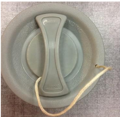
Turn off the valves