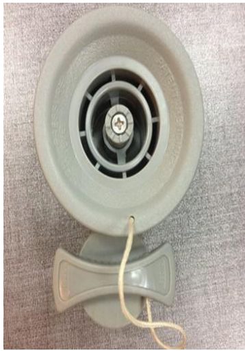
Find the valves