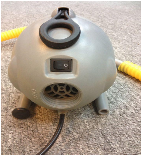
Turn on the switch to inflate

Inflate with the pump insert to valve. Use the included manometer to check correct working pressure. Check the manometer and use hand to press the product to feel pressure.