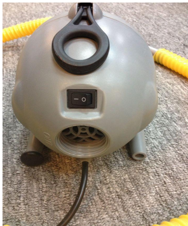
Turn off switch