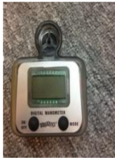
Manometer to check the pressure